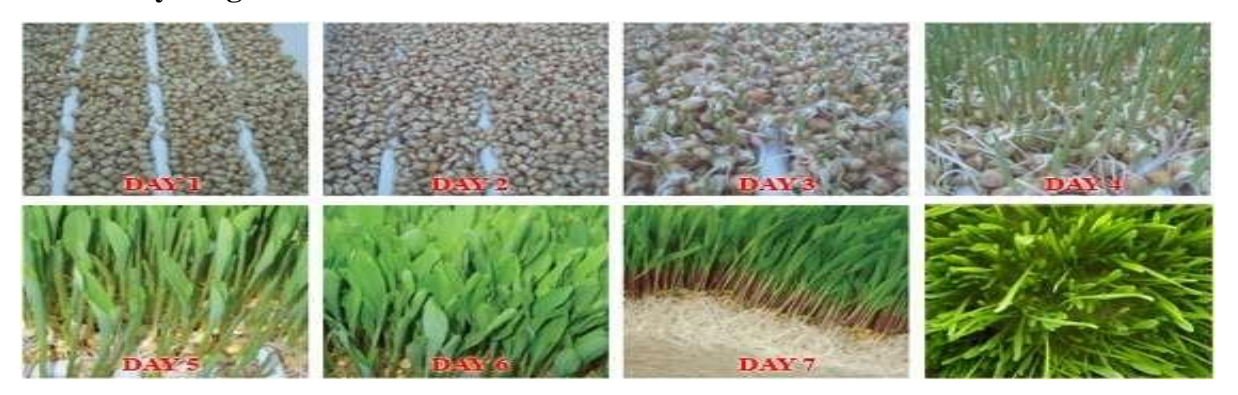
Take 7 days to grow from seed to fodder